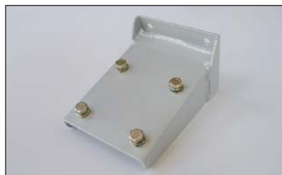
Lower Mounting Bracket