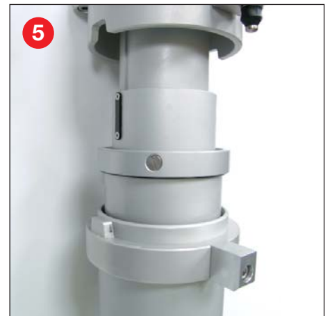
5 Mast top shroud to protect the keyed mast sections