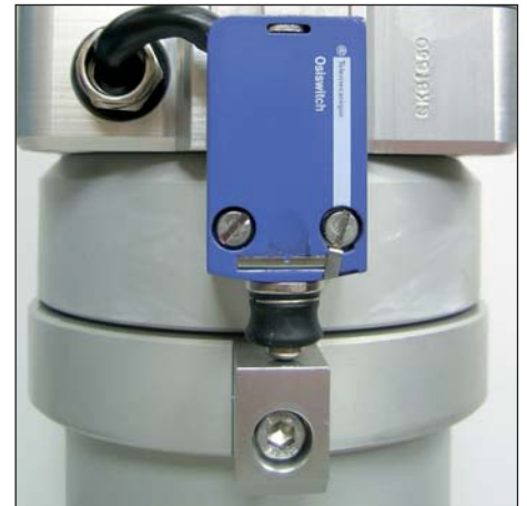
Standard pre-mounted and connected warning switch