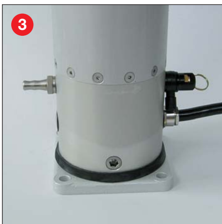
3 Fixed cardan mast base with air connection and overpressure/drain valve