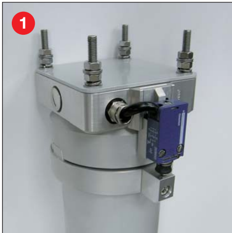
1 Mast top assembly with 4 x PG13,5 cable gland fitted to keyed mast sections