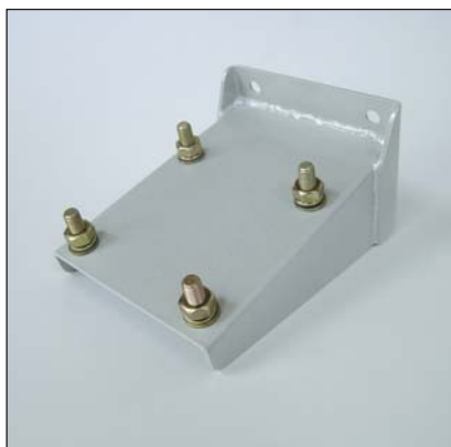
Lower Mounting Bracket