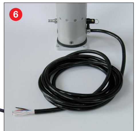
6 Power supply cable (5 metres) with numbered wires for lamp/beacon connection