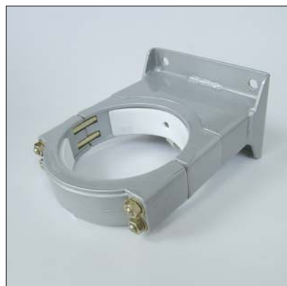
Upper Mounting Bracket