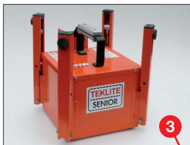
3 Battery case with carrying handle and stabilising legs, containing a 12 volt 38 Ah maintenance-free rechargeable battery. Finish : Orange RAL 2004