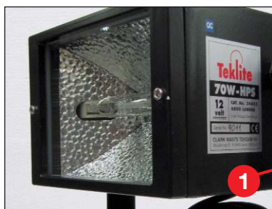
1 Metal lamp housing with integrated circuit board. Lamp protection : IP65