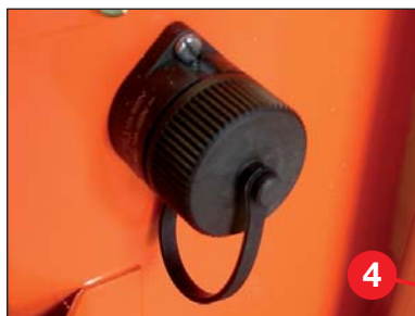
4 Battery case Binder socket for connection of lamp or charger