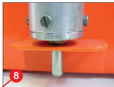
8 Bottom pin for quick and easy fitting of the mast onto the battery case