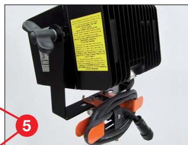
5 Swivel handle for tilting the lamp and cable holder for storing the cable with Binder connection plug