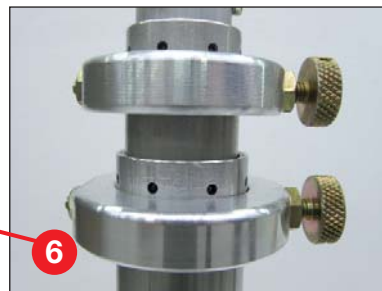
6 Natural aluminium seamless drawn mast sections with lockable thumb nuts