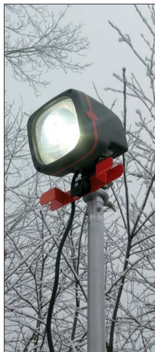
Model 35 Watt 12 Volt Xenarc