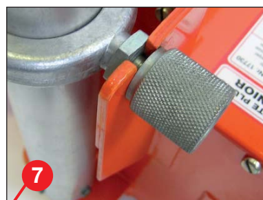
7 Mounting the mast on the battery case is secured with a single thumb nut