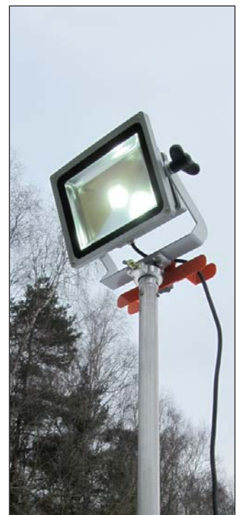
Model 30/50 Watt 12 Volt SMD-LED