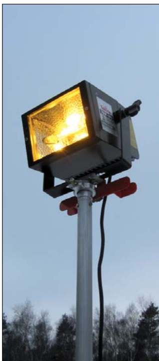
Model 70 Watt, 12 Volt High Pressure Sodium or Metal Halide