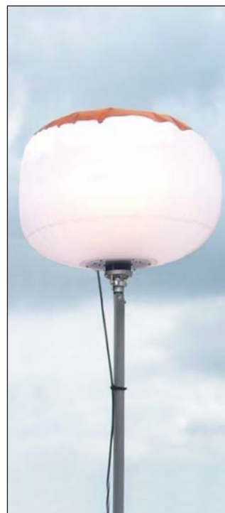
Model 60 Watt 12 Volt Fluo Compact