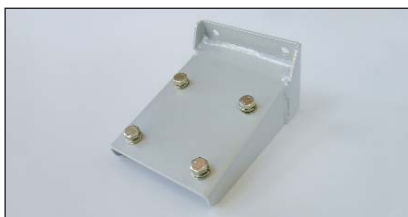
Lower Mounting Bracket