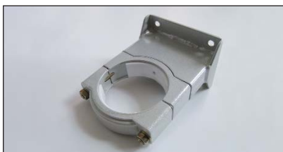
Upper Mounting Bracket