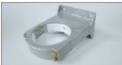
Upper Mounting Bracket