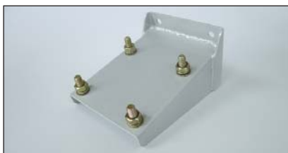
Lower Mounting Bracket